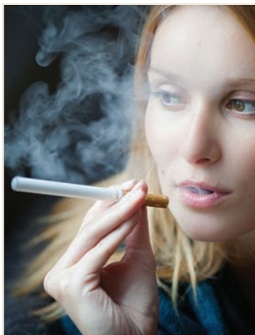
PHOTO 1: E-cigarettes do not produce a vapor (gas), but rather a dense visible aerosol of liquid sub-micron droplets consisting of glycols, nicotine, and other chemicals, some of which are carcinogenic (e.g., formaldehyde, metals, nitrosamines).

samplers from an e-cigarette attached to a mechanical smoking machine. For our exposure analyses we included seven of the 11 chemicals studied by Goniewicz